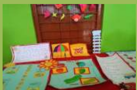
Fig-09 TLM Developed by Teachers