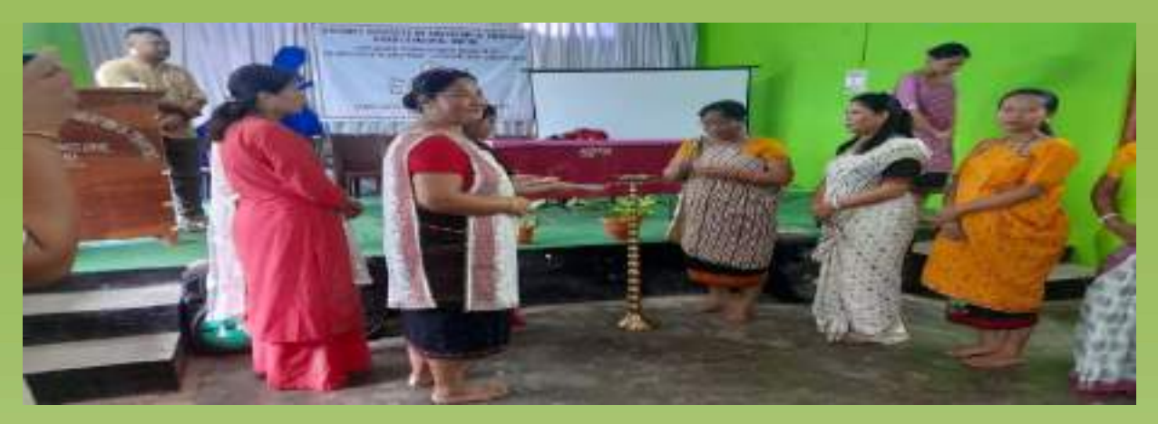
Fig-03 inaugural session (Lightning of Candle)