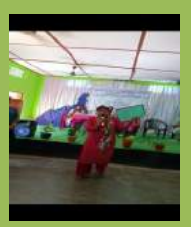
Fig-11 Presentation by RP and Participant(Teacher)