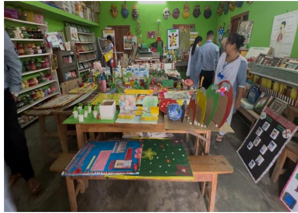
Fig-03 Cleanliness drive og Green house ,Resource Room etc