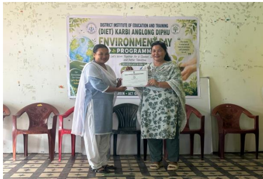
Fig-09 Distrubution of Certificate of Competition