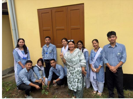
Fig-05 Plantation drive with Senior Faculty and Faculty