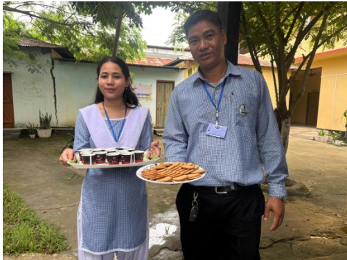
Fig-08 Tea and Biscuite provided by MGNCRE, Cell, DIET.