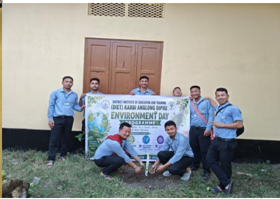
Fig-06 Plantation drive with Faculty Fig-07 Site for Plantation 2026 in DIET, Campus