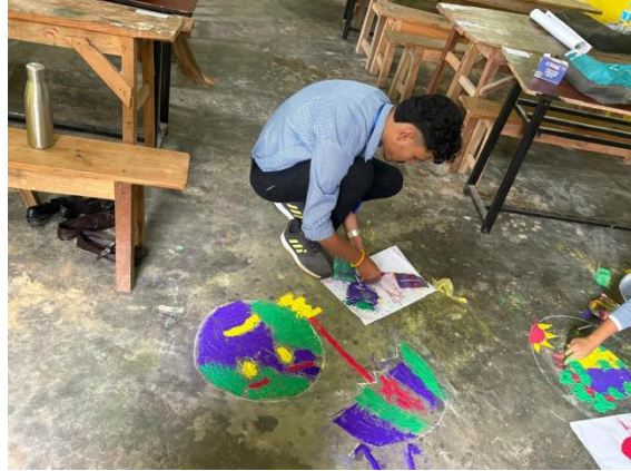
Fig-02- Teacher Trainees participating in Essay & Rangoli Competition